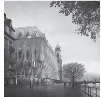
New Theater Lucerne, 2022, 4 th prize