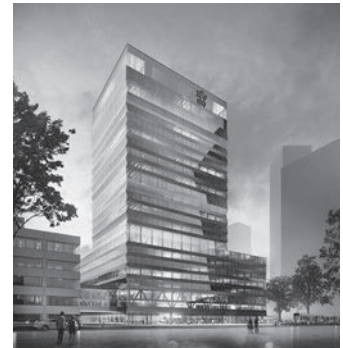
Banque Pictet in Geneva, 2019, 3 rd prize

For the continuation of our building culture, competitions are an indispensable basis; and they are equally important for our office. We acquire 95 % of our work through competitive procedures. We participated in more than 180 competitions, studies, or planner evaluation procedures. We could win 40 procedures and were awarded about 40 additional distinctions for urban and large-scale developments, stadiums, hospitals, universities, indoor-pools or museums.