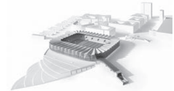
Stadion Hardturm Zurich, 2012, 2 nd prize