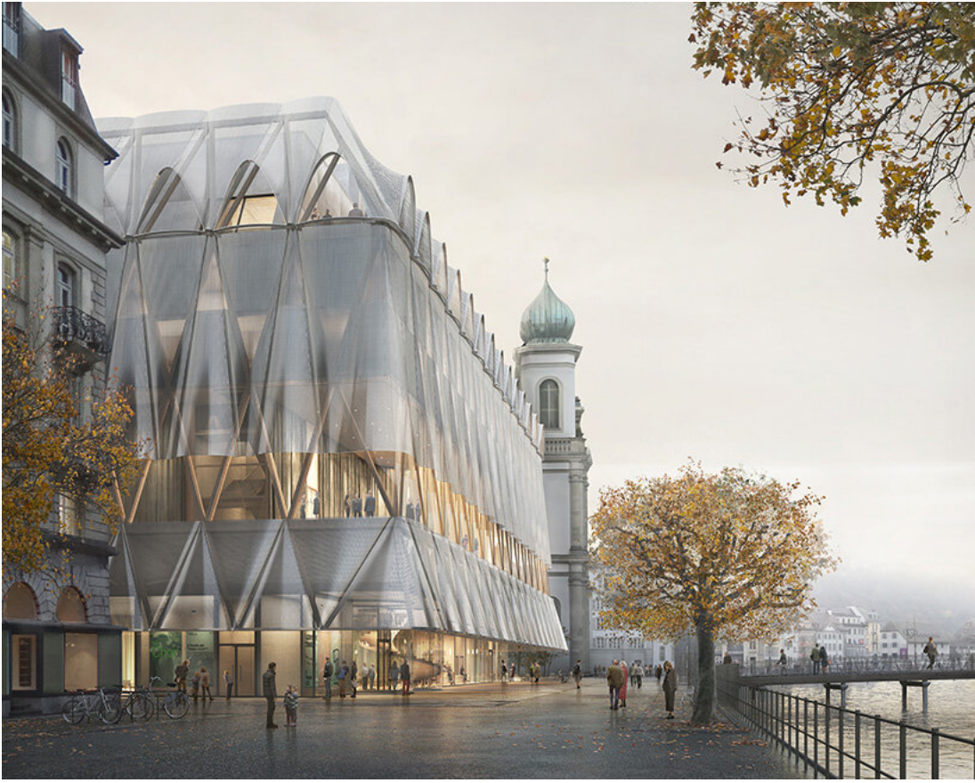
graber pulver envisions new lucerne theater draped in a soft curtain